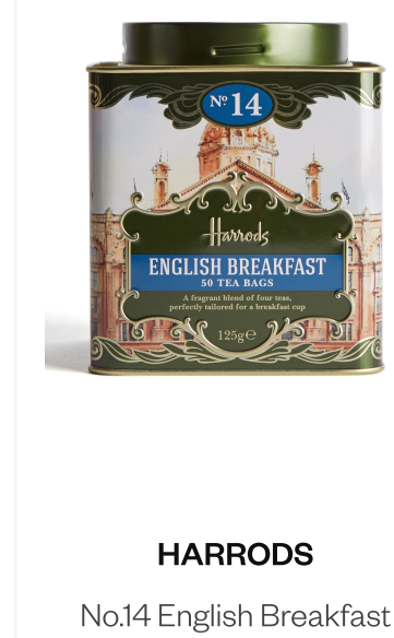
(50 Tea Bags) (125g e)