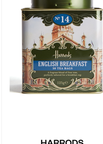
HARRODS No.14 English Breakfast